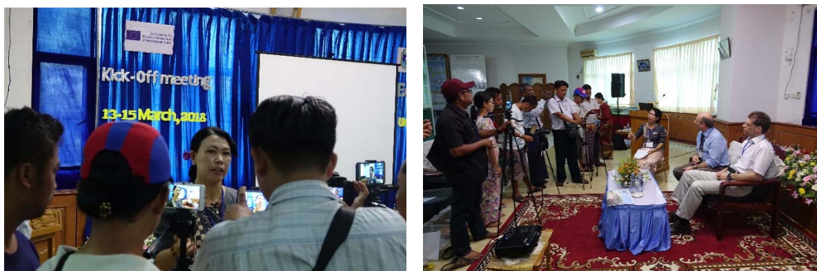
Figure 4. The background, aims and objectives of the MuEuCAP project were communicated to the Myanmar media by senior representatives of the project