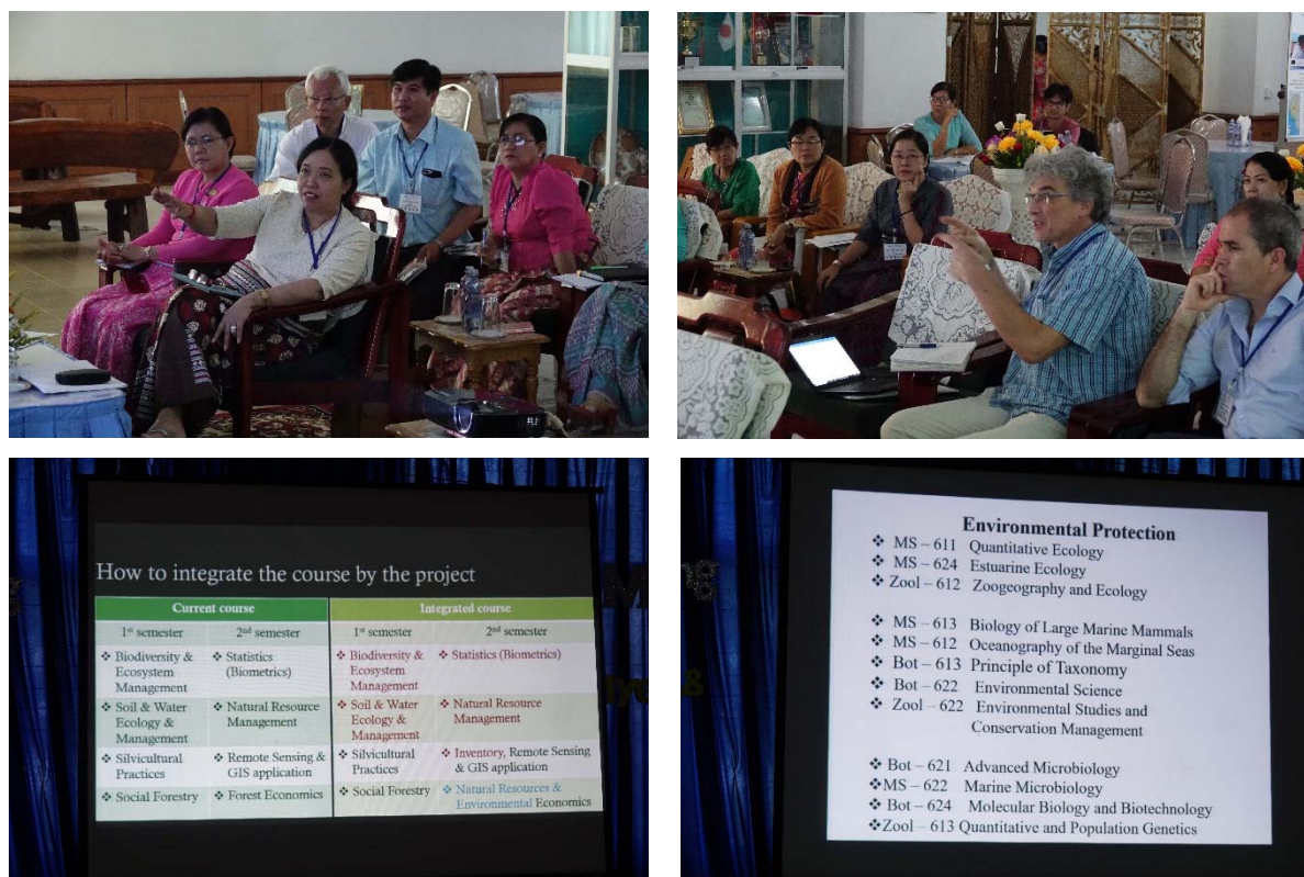
Figure 2. Top left: The kick-off meeting was attended by Rectors and Pro Rectors from Mandalay, Myeik and Mawlamyine Universities and a senior representative of the CSO MBNS (Myanmar Bird and Nature Society). Top right: Discussions about the project included input from Myanmar and European university staff. Bottom left and right: The Myanmar universities presented first outlines of their existing curricula in environmental protection.