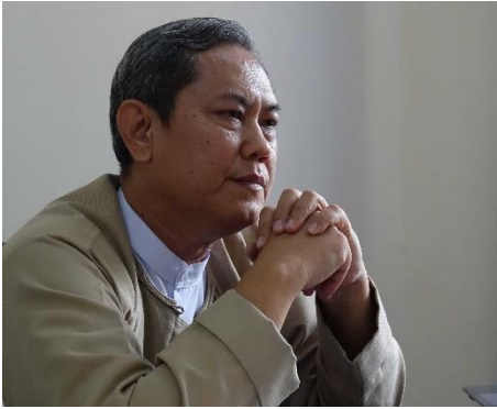
Figure 3. The Rector of the University of Forestry and Environmental Science, Yezin (UFES), Prof Myint Oo.

Item 2: Output: His Excellency the Union Minister strongly supported the project and encouraged the The Rector of the University of Forestry and Environmental Science, Yezin to participate without delay.