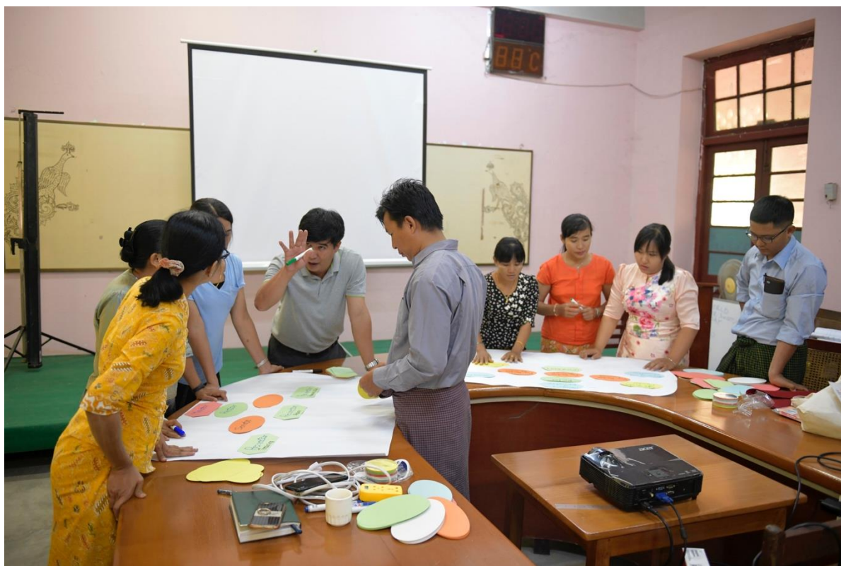
Figure 1: Teaching staff in the implementation of the situation analysis, University of Mandalay