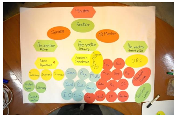
Figure 3: Visual representation of a Situations analyse