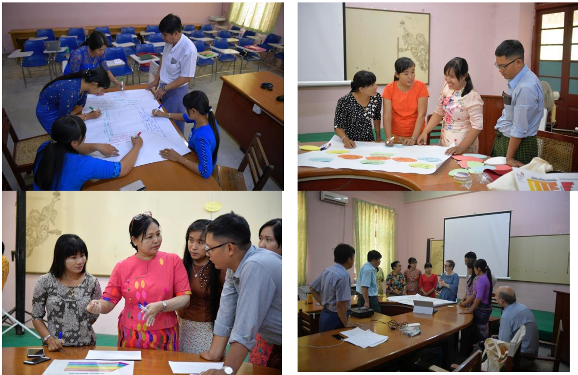
Figure 4: Working on different didactic topics

The workshop was built on interaction, interest in change and trust. Teaching is a very personal subject and change can only come from the teacher's own will. Of course you can influence from the outside, but sustainable change can only come from the inside. This workshop was characterized by mutual respect and learning from each other. The basic prerequisite for a successful workshop was to embark on new paths in teaching. The willingness of the change came from the teaching staff itself, we as workshop leaders could only show the participants didactic ways that they can follow. With this workshop we have initiated the change in the teaching activity.